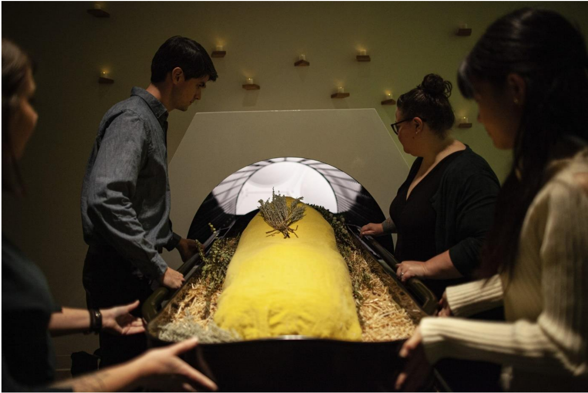
Family participating in a "laying in" ceremony at Recompose in Seattle, WA