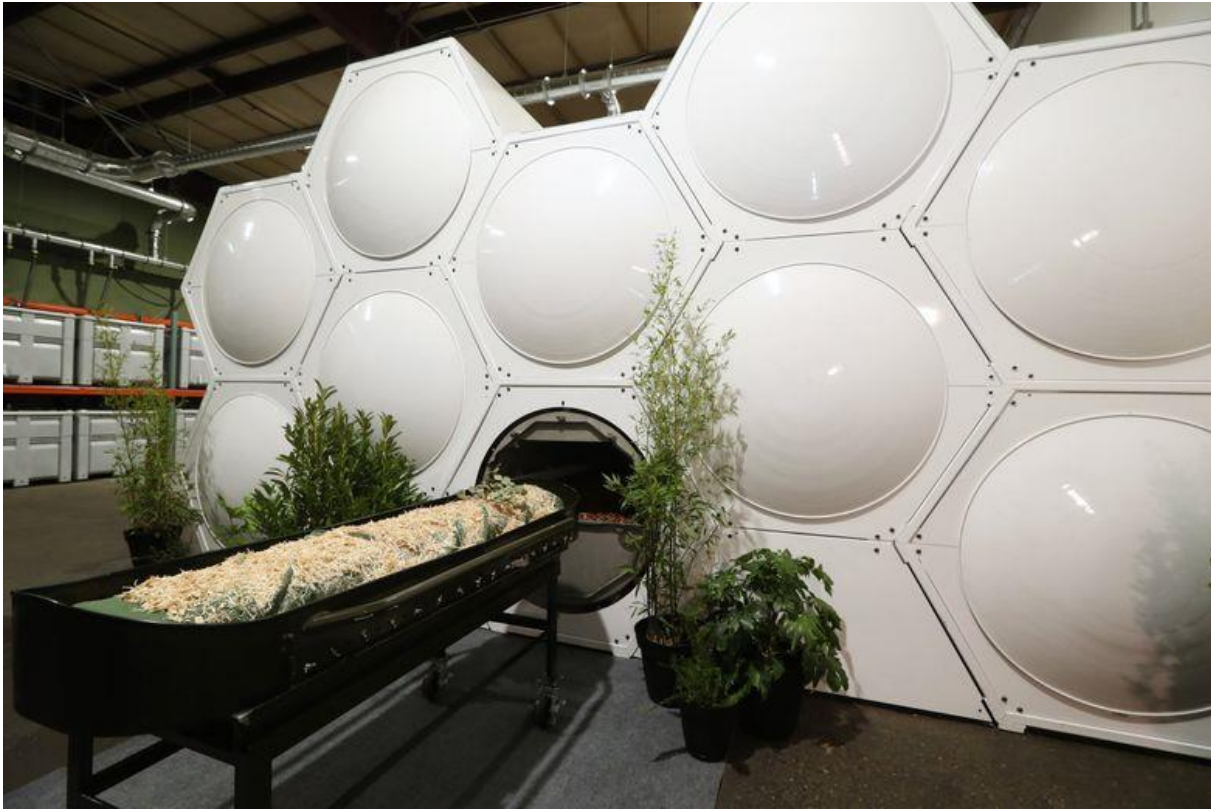
Recompose – NOR facility in Washington State

Dignified beautiful death care that is kinder to the planet