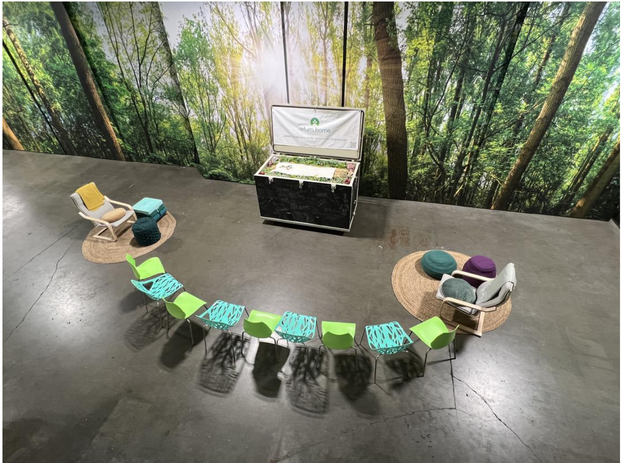
The family gathering space around a NOR vessel at Return Home in Auburn, Washington