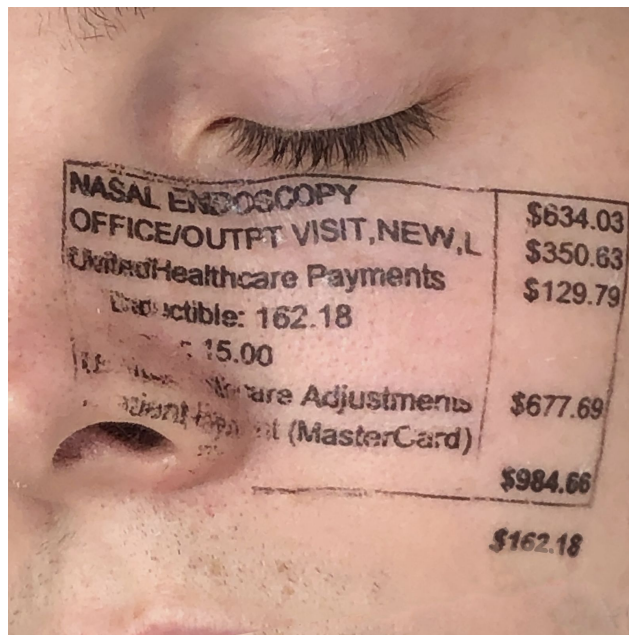
Image description: Declan McKenna's face is shown, with a temporary tattoo listing the surgery costs for a "Nasal Endoscopy" covering his skin. The total cost for the treatment being $984.66